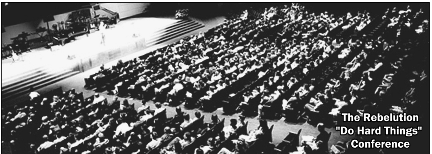
The Rebelution "Do Hard Things" Conference

In addition to the crazy road conditions, we were also appreciating the